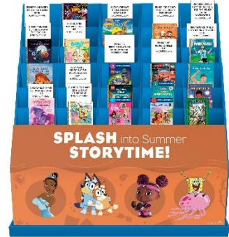
COVER DESIGN AND ASSORTMENT SUBJECT TO CHANGE. CONFIRM ASSORTMENT WITH RH SALES REP.

SUMMER ½ PALLET DISPLAY ON SALE 7/10/24 OFF SALE 8 /7/24